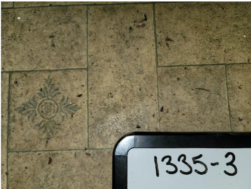
1335-3 Rolled Flooring Interior South, Northwest Bedrooms