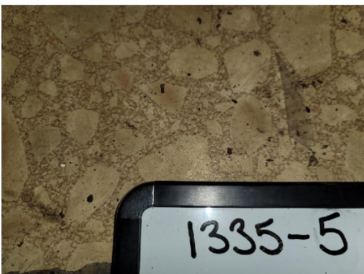
1335-5 Rolled Flooring/Adhesive Interior Bathroom