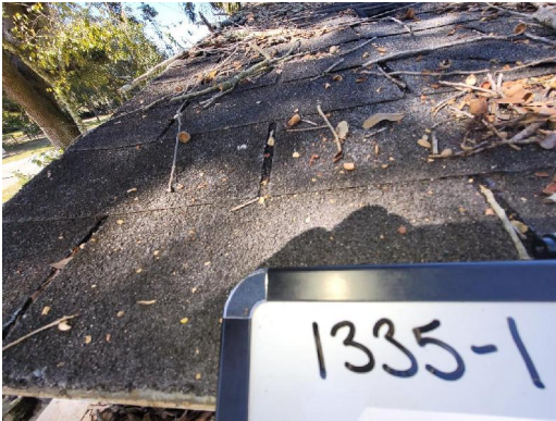
1335-1 Asphalt Shingle Typical Exterior Roof