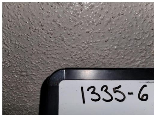
1335-6 Popcorn Ceiling Texture Interior Hall, East Bedroom