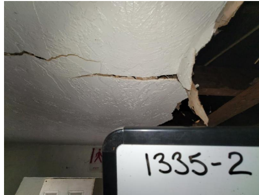
1335-2 Drywall/Joint Compound Typical Interior Walls/Ceilings