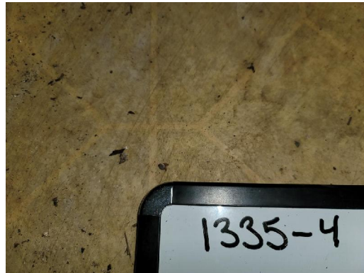
1335-4 Rolled Flooring/Adhesive Interior West Bedroom